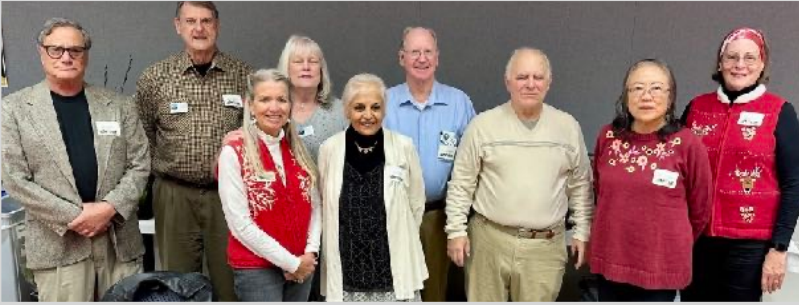
2025 POS Board Members in Attendance at Dinner